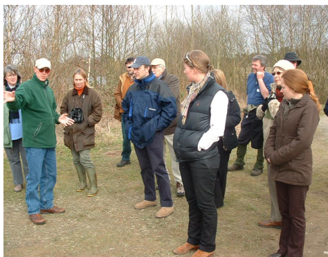
Delegates are given a tour of the Nunnery Lakes, Thetford

Although there are currently no more Brecks Awareness Days planned, they have proved to be very popular and informative days and we hope to be able to offer more in the future.