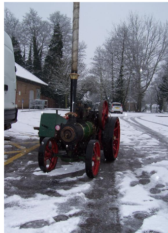
Even the snow didn't put off some engine owners

The Charles Burrell Museum, Thetford held their annual Miniature Steam Engine Rally on Easter Sunday. Due to the bad weather only 10 out of 40 planned engines were able to make an appearance, but despite the arctic conditions the museum had over 230 visitors on the day. The museum also Celebrates being awarded Accredited Museum Status, a nationally recognised award, which means it has proven it reaches high levels of museum standards. For more information on the Charles Burrell Museum, contact; T: 01842 765840 E: burrell@thetfordtowncouncil.gov.uk