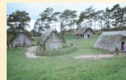
West Stow Anglo-Saxon Village

Reconstructed early Saxon village on site of excavated settlement. Different types of buildings represented, together with demonstrations of animals and crops of the Saxon period. All set within a 120 acre / 50 hectare country park with lake and nature trail. Visitor Centre and Anglo-Saxon Centre, with café, toilets (with disabled access). Programme of events. Nature trail and bird hide. Small entry charge for Village. Open daily 10 am to 5pm. Access from A1101 via minor road. Tel: 01284-728 718.