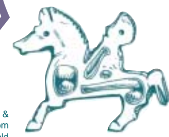
Romano-Celtic horse & rider brooch, from Hockwold