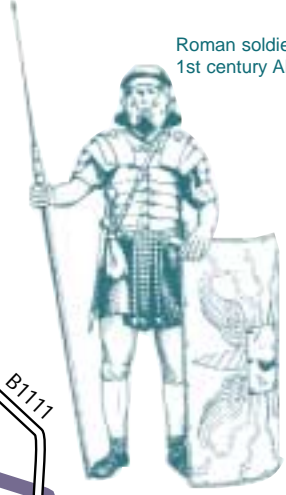
Roman soldier, 1st century AD