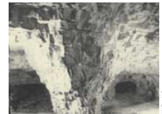
Underground galleries at Grimes Graves

Based upon the Ordnance Survey mapping on behalf of The Controller of Her Majesty's Stationery Office © Crown Copyright. MC 100031962