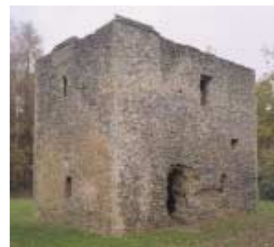
Thetford Warren Lodge

Ruins of impressive late 12th-century moated manor house, not a castle, with large open hall and attached two-storey chamber block. Domed brick ice-house on north-west corner of moat. Small car park next to church (no charge). Free entry. Tel: 01604-735400.